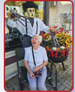
Heath Village residents enjoying the Branchville Annual Scarecrow Contest