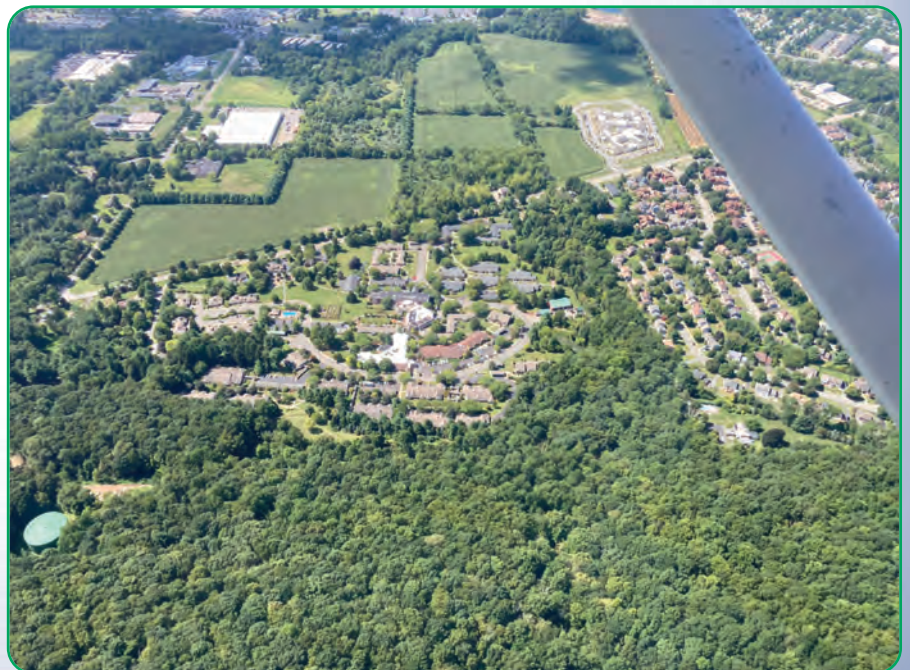
Heath Village From 1,500 feet