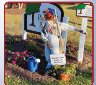
Heath Village scarecrow displays